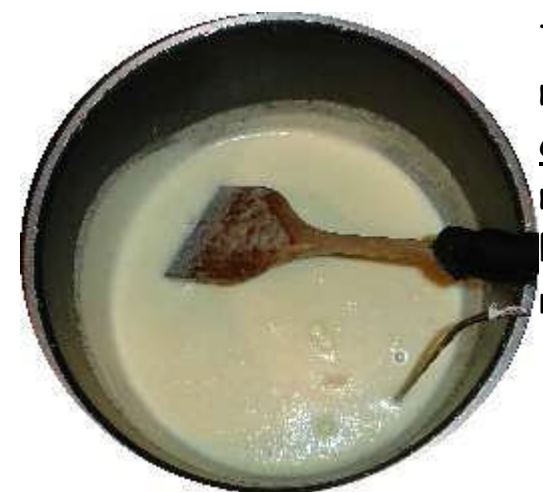
Step 6 - Pour the egg yolk mix into the pot of hot milk

Then pour the egg mixture back into the pot of hot milk and increase heat to medium. Stir the mixture constantly with a wooden or plastic spoon, until the mixture is thickened (like gravy) and registers between 170°F and 180°F (check with an instantread thermometer, like the ones with a probe).