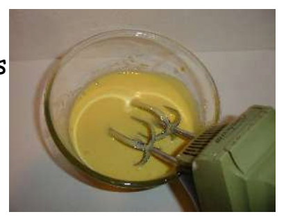
All images and text Copyright © Benivia, LLC 2006 All rights reserved.

Put the egg yolks in a medium bowl and whisk until they are thickened (it only takes about 2 minutes. I use a hand mixer on low speed.