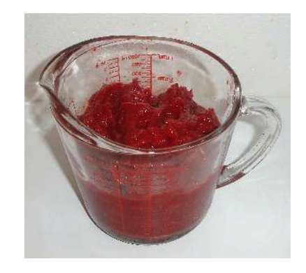
Step 9 - Mix the milk/cream mix with the fruit and put the canister in the ice cream maker

To prepare the fruit just prepare it as you would for eating, then blend it in your food processor or blender for a few minutes. Here are some tips: