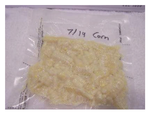
Step 9 - Done!

Pop them into the freezer, on the quick freeze shelf, if you have one!