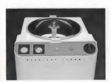
Stationary Mixing Container

Before you begin, be sure to locate the gelato maker away from sources of heat, and do not place it against the wall (allow at least 5" of space to permit air to escape from the side air-vent opening).