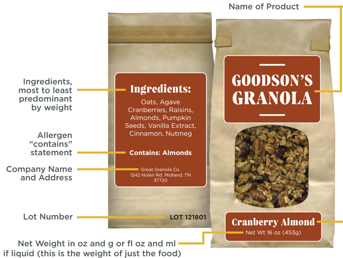
Figure 1. Required label components for manufactured foods.