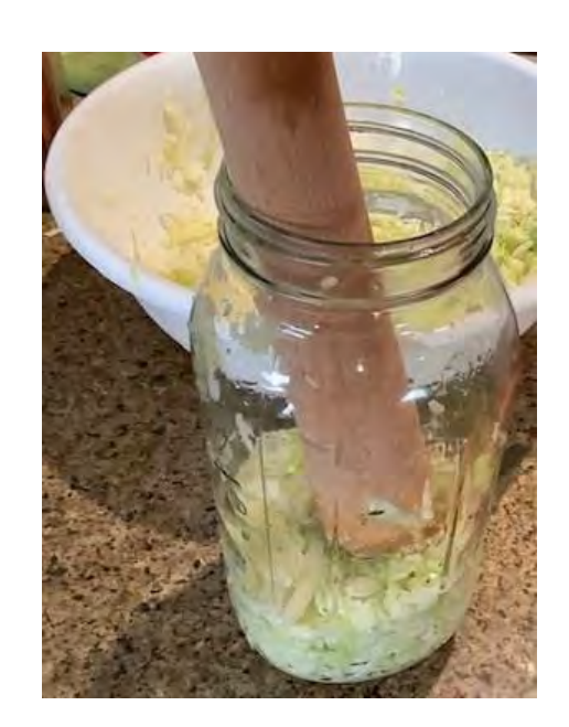
Page 5 of 11