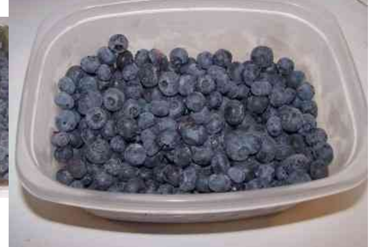
Step 5 - Put them in the freezer

Pop them into the coldest part of the freezer, or the quick freeze shelf, if your freezer has one!