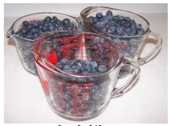
Page 3 of 13

It takes about 10 cups of raw, unprepared blueberries per batch to make about 3 cups of blueberry butter. Between the air spaces in loose blueberries and the fact that it cooks down by about 1/3; the final result is half of the loose berries; for each cup