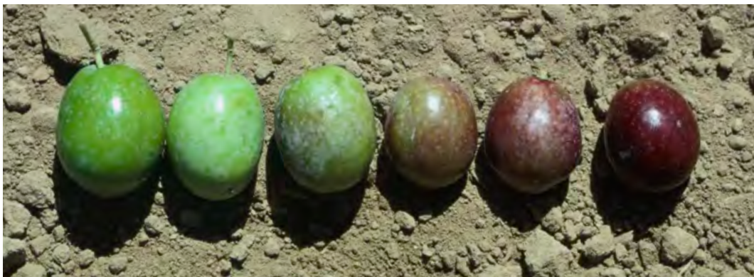
Figure 1. Freshly harvested olives at different stages of ripeness: green-ripe (1 and 2); yellow-green to straw (3); rose to red-brown (4 and 5); and red-brown (6) (may be too soft for some types of olive curing). Not shown are naturally black ripe olives (also described as dark red to purplish black).

Naturally black ripe olives are harvested in California starting in mid-November and continuing through December, depending on the variety, crop yield, and region, and on weather conditions. When mature, these olives will release a reddish black liquid when you squeeze them and their flesh will be nearly completely pigmented. Ripe olives bruise easily and must be handled with care.